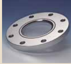
Type 19.BIO: Bolt On Sight Glass for Sterile Applications O-Ring Seal