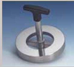
Type 73.SW: Sight Glass Discs with Wiper