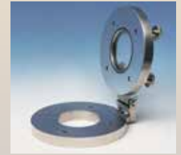
Type 80.SC: High Pressure Hinged with O-Ring Seal