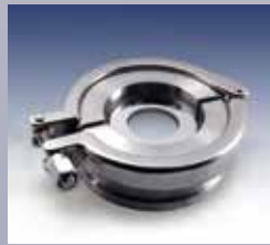
Type 80.TCI.CC: Sight Glasses for Clamp Style Flush Mount