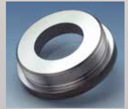
Type 64: Threaded Sight Glasses - Round head