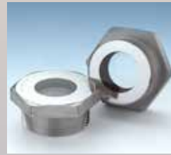
Type 61: Threaded Sight Glasses - Hexagon head, NPT or other threads