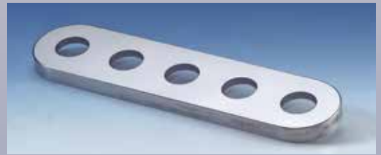
Type 99.LSG: Fused Metal Elongated Sight Glass for Rectangular & Obround Sight Windows and Armored Liquid Level Gages