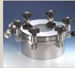
Type 99.ZIM: Pressure Manway with Integrated Metaglas