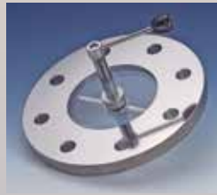
Type 13.SW: Sight Glass Flange - with Wiper