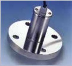
Type 19.BIO.USL33: Bolt On Sight Glass for Sterile Applications using Sight Glass Luminaires or USL-33