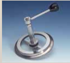
Type 80.SW: MetaClamp® - with Wiper