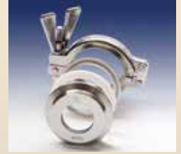
Type 80: MetaClamp® Sanitary Clamp Fitting