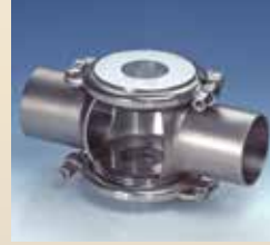
Type 99.TUC: Sight Glass with Luminaire for Varivent-In-Line Fittings