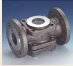
Type 77: Sight Glass Discs for Visual Flow Indicator Fittings