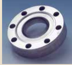
Type 19.CF: Sight Glass Discs for ConFlat high vacuum applications