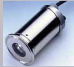
Type 80.USL33: MetaClamp® Sanitary Clamp Fitting with USL-33 Luminaire