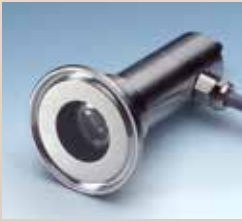
Type 80.USL01: MetaClamp® Sanitary Clamp Fitting with USL-01 Luminaire