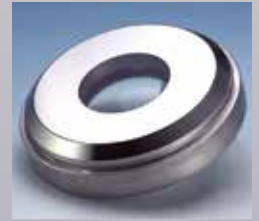
Type 83: Sight Glass Discs for Aseptic Screwed Pipe Connection DIN 11864