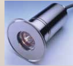
Type 80.ESL25: Sight Glasses for Use with Clamp Connections and Sight Glass Luminaire ESL-25 EX