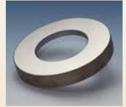
Type 76: Sight Glass Discs for ANSI Flange connection