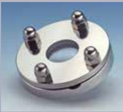
Type 99.NA: Sight Glasses for Flush Mount Hygienic Weld Pad