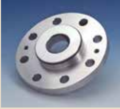
Type 903: Sight Glass Discs for Sterile Applications, stepped for flush mount