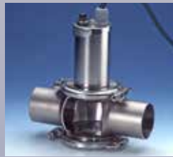
Type 99.TUC.USL33: Sight Glass with USL-33 Luminaire for Varivent-In-Line Fittings