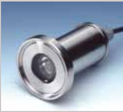
Type 83.USL33: Sight Glass Discs for Aseptic Screwed Pipe Connection DIN 11864-1 for Mounting Luminaires USL-33