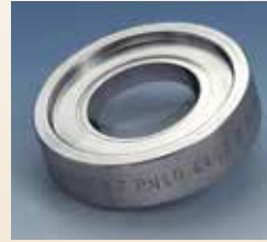
Type 74: Sight Glass Discs with Tongue and Groove Joint