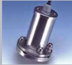
Type 99.NA.USL33: Sight Glasses for NA-Connect Fitting with USL-33